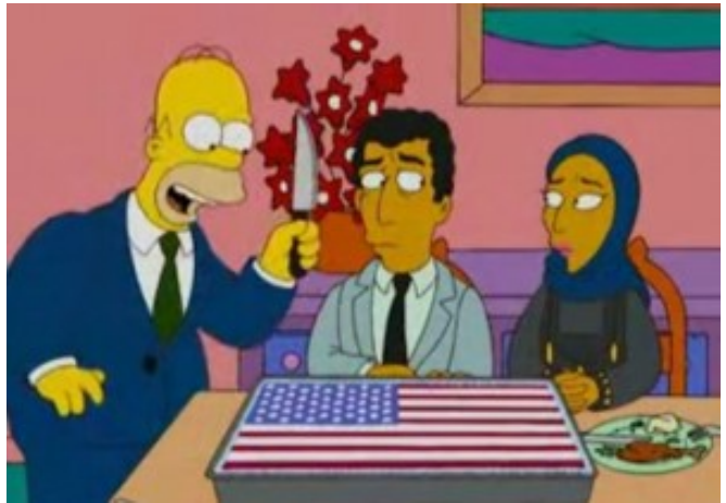
After suspecting that his neighbors are terrorists, Homer Simpson throws them a "Pardon My Intolerance" party. (episode "Mypods and Broomsticks", 2008)