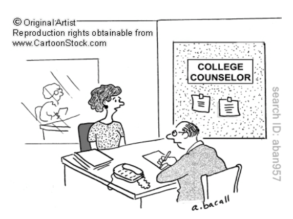
"I want to go out of town so that I can become a fully independent person, but near enough so that I can bring my laundry home."